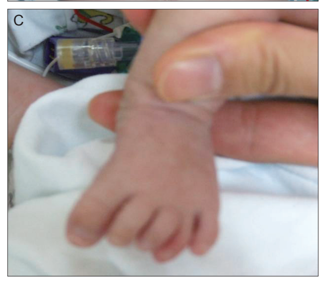
Fig. 1. Photographs of the general appearance in mosaic trisomy 14 syndrome at 2 weeks of age. The patient had a prominent forehead, narrow palpebral fissure, and broad nose (A), right-sided fifth finger clinodactyly (B), and prominent long phalanges of the fourth digits on both feet (C). Informed consent was received from parents of the patient.

in 1970, and there are several characteristic features which may enable the clinician to suspect this diagnosis prior to