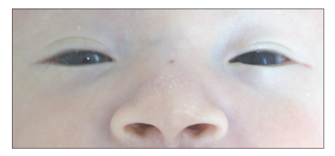
Fig. 2. Photographs of external ocular appearance in mosaic trisomy 14 syndrome at 2 weeks of age. The patient had a narrow palpebral fissure with hypertelorism and telecanthus.

in 1970, and there are several characteristic features which may enable the clinician to suspect this diagnosis prior to