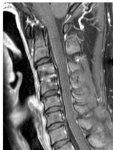
Fig. 3. Gadolinium-enhanced T1-weighted sagittal MR image of the lesion after 4 months of antibiotic therapy showing the cervical epidural abscess had significantly decreased in size. However, the presence of a hyperintense and contrast-enhanced disc space and vertebral body suggested discitis and osteomyelitis.

graphy at four weeks showed no change in the vegetation. MRI taken after four months of treatment revealed complete resolution of discitis and osteomyelitis (Fig 3). The patient was well at his 6-month follow-up, and symptoms almost completely subsided.