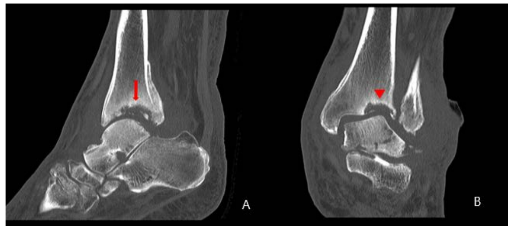
Figure 3. Initial left ankle: (A) sagittal and (B) coronal computer tomography scans. (A) Multiple bony fragments were scattered in the distal tibia (arrow). (B) The bone density was increased around the ankle and the tibial bone defect had a similar shape to the talar dome (arrowhead).