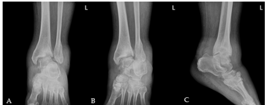
Figure 2. Initial left ankle X-ray. (A) Anteroposterior, (B) mortise, (C) lateral. Subluxations of the ankle joint and bony fragments were seen. An old healed fracture of the lateral malleolus was also visible.