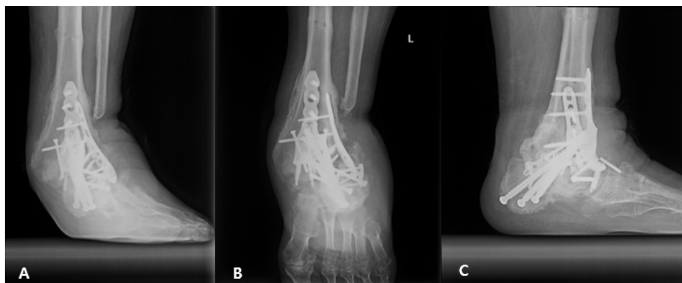
Figure 8. Left ankle X-ray. (A) Anteroposterior, (B) mortise, and (C) lateral images acquired 1 year after the final surgery. The X-ray showed progressive bone collapse but no worsening of alignment.