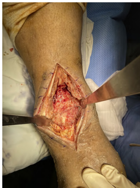
Figure 6. Intraoperative findings during the second surgery. A large quantity of fragile, chronic inflammatory tissue was observed around the ankle joint.

The CRP level remained high after the first surgery; therefore, the infectious diseases department was consulted and intravenous antibiotics were administered. Due to the persistently raised CRP level at 1 month after the first surgery, we performed a second surgery to insert an anti-bead and apply an external fixator. During the second surgery, soft tissue dissection revealed large quantities of fragile, chronic inflammatory tissue around the ankle (Figure 6). The tissue was removed by debridement and curettage. Then, an anti-bead was inserted and the Ilizarov apparatus was applied.