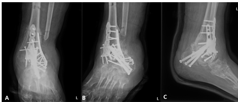
Figure 7. Left ankle X-ray. (A) Anteroposterior, (B) mortise, and (C) lateral images acquired 2 months after the final surgery. The images were obtained after removal of the external fixator.

After the final surgery, the patient was regularly followed-up in the outpatient clinic; this is still ongoing. He has been advised to use a cam-walker and avoid weight bearing. The patient does not have significant pain but walking difficulty has persisted. The 1-year follow-up X-ray (Figure 7) showed no disruption of alignment but worsened bone collapse compared to the 2-month follow-up X-ray (Figure 8). The progressive bone collapse may require additional surgery. Although the patient has maintained alignment due to the avoidance of weight bearing, he may require amputation if subluxation or dislocation recurs.