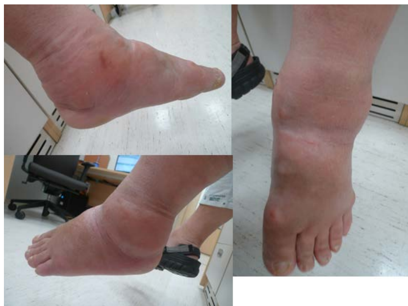
Figure 1. Left ankle at the time of presentation. There was no abrasion or laceration. The skin overlying the ankle joint was swollen and red.