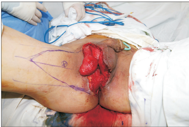
Fig. 2. A 48-year-old male with scrotal and perineal defects due to Fournier's gangrene. Using handheld Doppler, we marked the blue circle meaning the perforator of medial femoral circumflex artery and designed V-Y pattern fasciocutaneous flap for reconstruction.

the thigh was used, with dissection in the fasciocutaneous plane and evidencing the gracilis muscle throughout the bed, without direct handling. Under using microscope, the perforator of MFCA to skin flap which runs deep between the adductor magnus and longus was found and preserved (Fig. 3, 4). The patency of the vessel was well. After flap inset, two hemovac were inserted and flap was repair with No.4-0 Nylon. The donor area was submitted to primary closure, by planes. Ten days postoperatively, the patient experienced no complication within adequate functional and aesthetic results (Fig. 5).