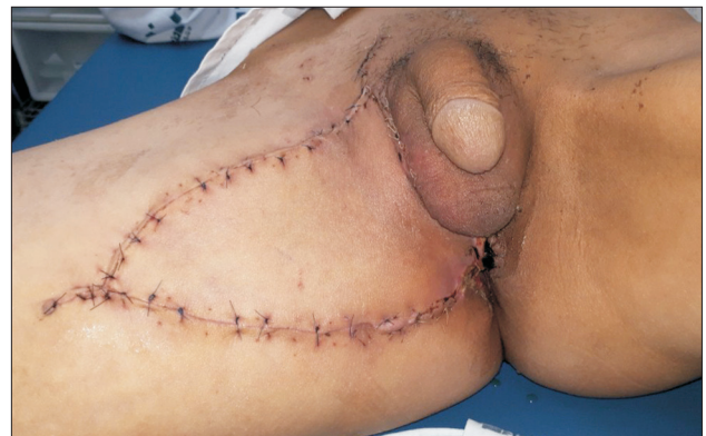
Fig. 5. Postoperative images after 12 days. There was no complication within adequate functional and aesthetic results.