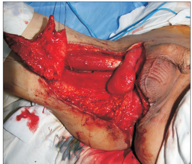
Fig. 4. Dissected and mobilized flap. Medical femoral circumflex artery perforator preserved V-Y pattern fasciocutaneous flap was elevated without direct muscle handling.