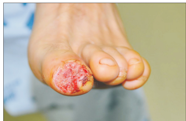
Fig. 1. Skin and soft tissue defect on his left great toe.

to plantar side of metacarpal area. This symptom had started 2 months ago. Previously, he had trauma by electrical saw and ALT free flap was performed on medial side of his left great toe