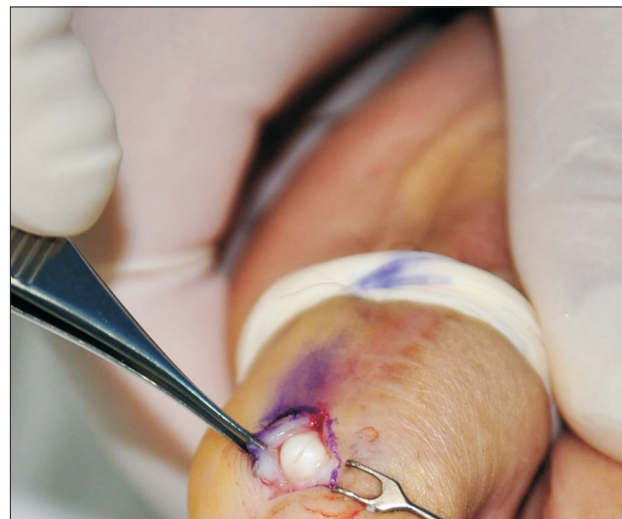
Fig. 3. Mass under Anterolateral thigh free flap.

In a retrospective study, we confirmed he had had another operation, ALT free flap, in the same area. Epidermal inclusion cyst is rare on the sole of the foot and the palm of the hand. In the glabrous skin, the epidermis is generally less innervated. 8 Injuries to the skin such as traumatic skin damage like smashing