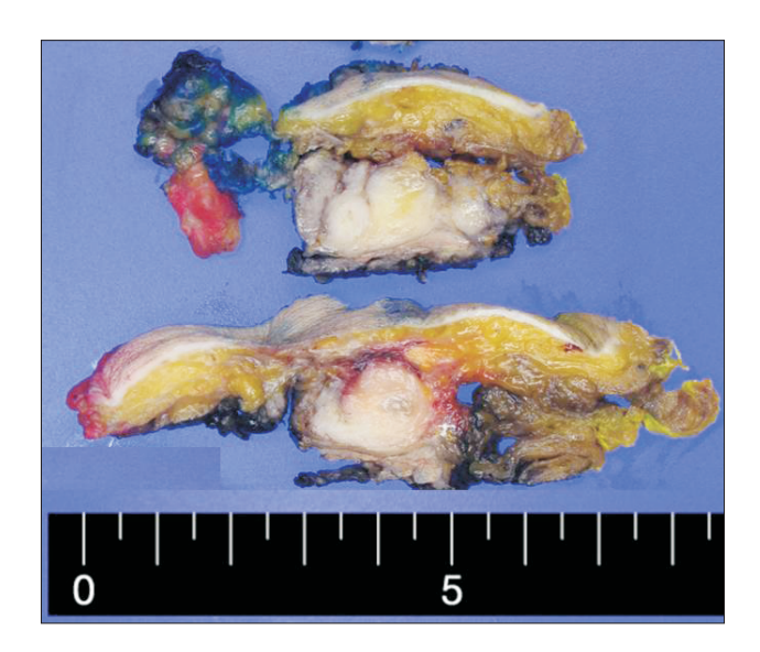
Fig. 3. Gross examination of the pleomorphic leiomyosarcoma. The mass is a well-demarcated nodular, and located between subcutaneous fat tissue and skeletal muscular tissue. The cut surface reveals homogeneous grey whitish solid nature.

Soft tissue sarcoma is a rare disease about 1% of adult malignancy. A second primary soft tissue sarcoma occurring in a previously diagnosed adult soft tissue sarcoma patient has; however, 12.5-fold the risk of a similar lesion occurring in a person with no history of the disease<sup>7</sup>. The rate of synchronous/metachronous neoplasms is 7.5% in soft tissue sarcoma patients compared with 1% in the general cancer population<sup>8</sup>. As per Grobmyer et al.<sup>7</sup>, the annual incidence of a non-radiation-induced second primary soft tissue sarcoma is low, and reported to be 4 per 10,000 population. To the best of our knowledge, however, only 24 well described examples of histologically distinct synchronous or metachronous sarcomas have been published. These include 18 examples of synchronous or metachronous soft tissue sarcomas. When a second tumor arises, often the initial clinical suspicion is of recurrent or metastatic tumor. In this case, primary tumor, fibrosarcoma cells are negative for SMA and Ki-67 but secondary tumor, pleomorphic leiomyosarcoma cells are positive for SMA and 30% positive for ki-67. Crucially, the second neoplasm was biopsied and morphological